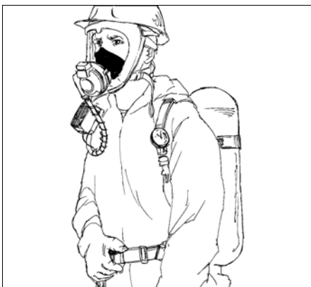
A Self-Contained Breathing Apparatus (SCBA)

A worker may use a half-facepiece respirator with vapour-tight chemical goggles when working on a chlorine system where there is a chance of a small leak. This type of respirator is permitted only when the chlorine concentration is below 5 ppm.