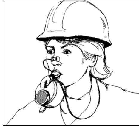
An escape respirator

There is one exception: As long as the worker is not working on the system itself, an escape respirator may not be necessary if the worker is never more than 2 m (6 ft.) from the exit door and no part of the chlorine system is between the worker and the exit door. This is because it would take longer to put on the respirator than it would to exit the room.